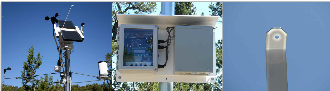
▲ Figure 1: PST Prospector™ system with MiniTrak II™ and fully integrated turnkey weather monitoring station