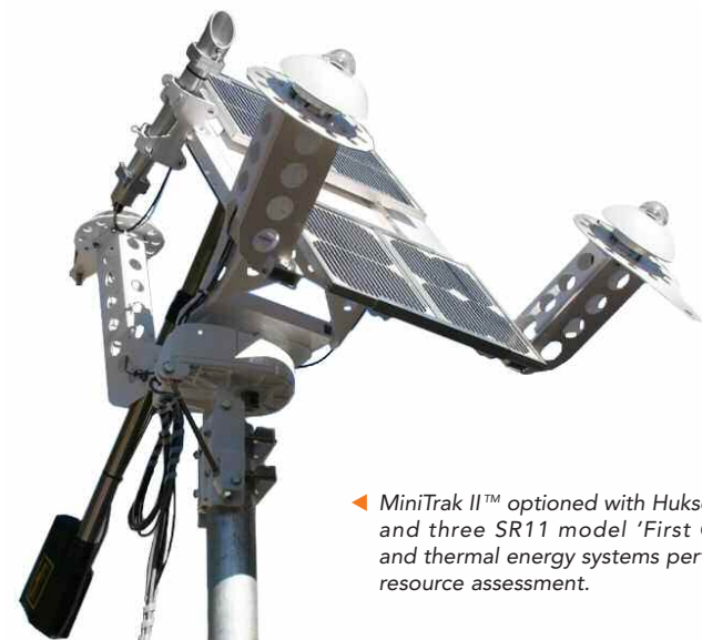
◀ MiniTrak II™ optioned with Hukseflux DR01 model 'First Class' pyrheliometer and three SR11 model 'First Class' pyranometers, ideal for solar PV and thermal energy systems performance testing and high accuracy solar resource assessment.

Depending on the application requirement, the MiniTrak II™ can be optioned with a single pyrheliometer, or fully equipped to measure all constituent global solar irradiance components in the horizontal and/or POA modes. Such system scalability offers maximum application potential, particularly for the solar renewable resource assessment community, where technology and mounting orientation with respect to the Sun are often quite varied. A 'PV Rack' option is also available for the MiniTrak II™, permitting the mounting and real-world efficiency testing of user supplied PV panels (to one square meter) in the standard two-axis tracking mode (normal incidence), single axis mode (azimuth tracking only), or fixed angle stationary mode.